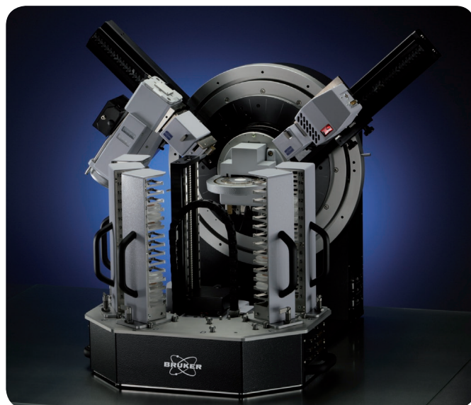
Fig. 1: D8 ADVANCE with AUTO-CHANGER

The robot transfers the samples to the rotation sample stage mounted to the D8 goniometer. The stage allows permanent rotation during the measurements, as well as phi-scans or positioning to align asymmetric samples into the X-ray beam.