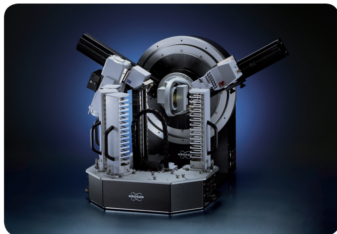
Fig. 3: D8 ADVANCE in transmission mode, AUTO-CHANGER and LYNXEYE detector

On top of this flexibility, an instrument equipped with the AUTO-CHANGER can be reconfigured in minutes including removal and re-installation of the AUTO-CHANGER without any realignment effort, when another type of analysis is required, e.g. phase analysis under non-ambient sample conditions. Thus, the instrument executes not only routine jobs over night or during weekends, but it can also be used to do complex investigations at any time.